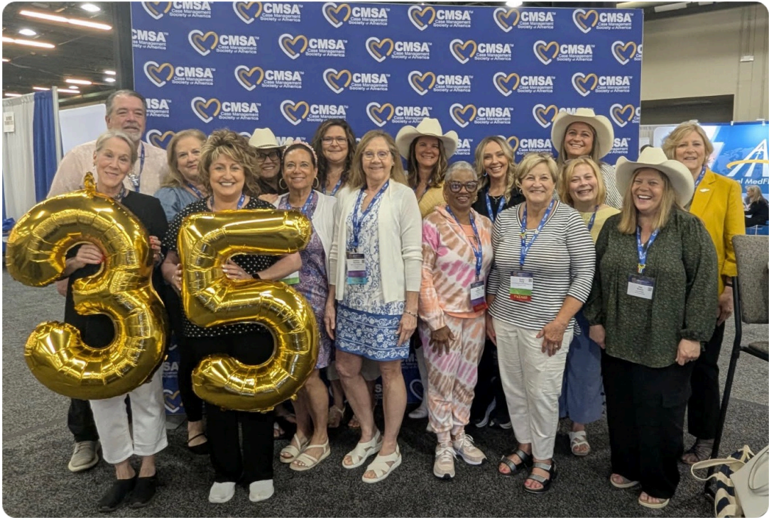
The Ambrose case managers traveled to Dallas, Texas to attend the 35th anniversary of our trade association, the Case Management Society of